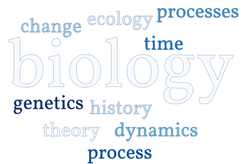
Fig. 1. The relative font sizes in this word cloud represent the frequencies of the ten most common 'evolutionary ___' bigrams in the journal Nature during the 2000s decade.

We are sensitive to the worry that housing the content in this way constitutes, in essence, yet another example of "data siloing" in the digital humanities—the construction of another closed