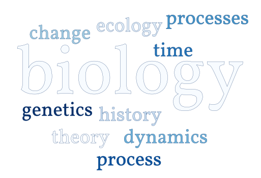
Fig. 1. The relative font sizes in this word cloud represent the frequencies of the ten most common 'evolutionary ____' bigrams in the journal Nature during the 2000s decade.

We are sensitive to the worry that housing the content in this way constitutes, in essence, yet another example of "data siloing" in the digital humanities—the construction of another closed